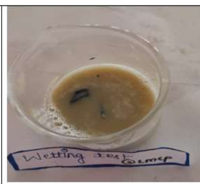
Fig 16: Wetting Test