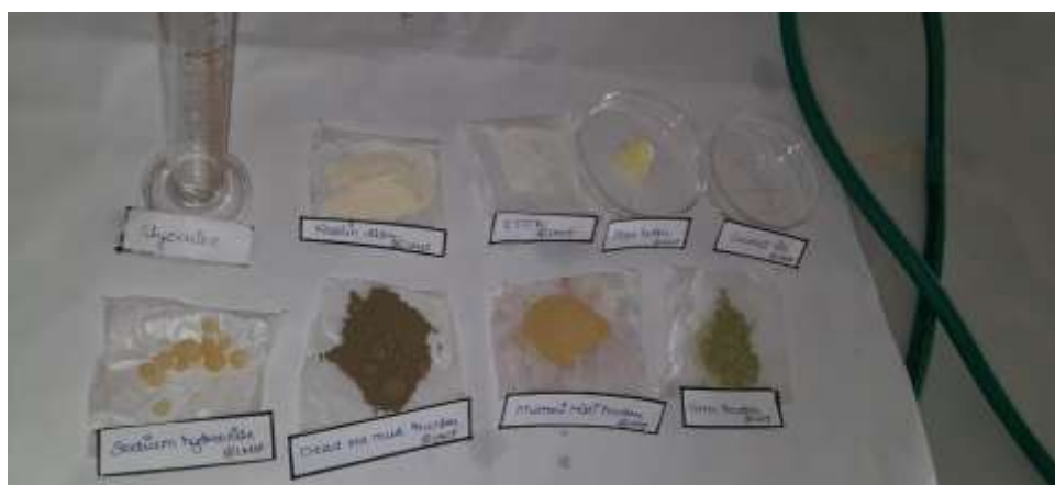
Fig 1. Materials used in the formulation

Function: Prevents soap scum formation, improves stability, enhances effectiveness in hard water, and increases shelf life [22-23].