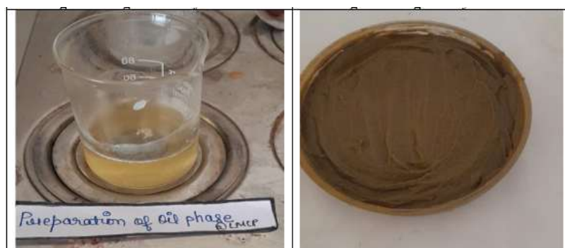
Fig 4: Preparation of Oil Phase Fig 5: Final Product