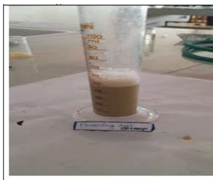
Fig 17: Preparation of Oil Phase