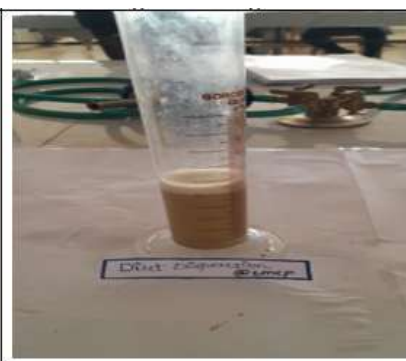
Fig 18: Final Product