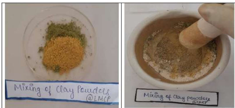
Fig 2: Mixing of All Clay Powder Fig 3: Mixing of Clay Powders

The final soap bars were stored in a clean, dry, and airtight container to protect them from moisture and contamination until further evaluation [31].